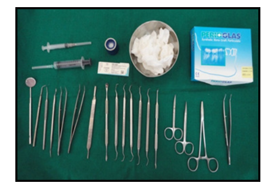
Fig-1: Armamentarium Used During Corticotomy

8 orthodontic patients (15-27 years) who needed orthodontic treatment with extraction of upper first pre molar were included. The patients selected were undergoing orthodontic treatment the Department of Orthodontics in and Dentofacial Orthopedics (Fig 1 & 2).