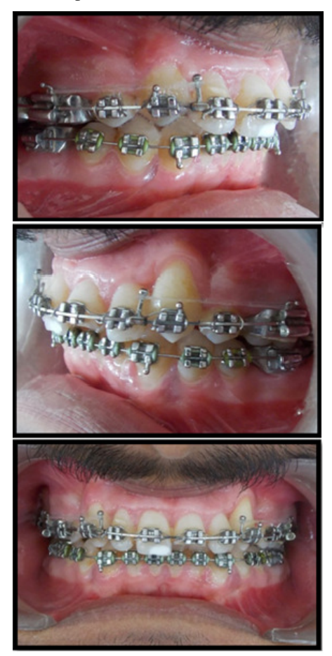
Fig-6: Post Space Closure

We have followed the same protocol (Fig 6).